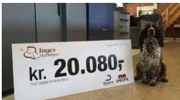
Presentation cheque to Inges Kattehjem